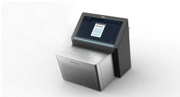
Figure 1. Alto Instrument

Alto™ is a high-throughput benchtop surface plasmon resonance (SPR) instrument providing detailed binding kinetics and affinity data for a wide variety of molecular interactions (see Figure 1). Alto uses digital microfluidics (DMF) instead of traditional pumps, valves and tubing for sample handling and delivery to the SPR sensors for label-free analysis. DMF is a liquid handling technology capable of accurately controlling and manipulating discrete nanodroplets with electricity. DMF-powered SPR significantly improves performance, data accuracy and consistency while enabling all sensors and fluidics to be contained in a single, disposable Alto Cartridge. This revolutionary technology only requires 2µl of sample for full kinetics, performs serial dilutions automatically on-chip, and delivers near instantaneous switching between buffer and sample.