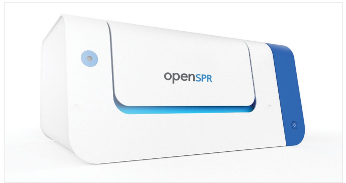
Nicoya Lifesciences' OpenSPR™